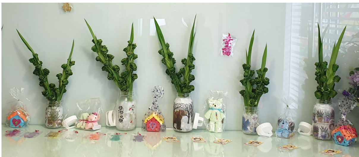
Other gift ideas – pandan leaf flowers, hand drawn caricatures of BESTs, stuffed toys, decoupage bottles/lamps, posters, cards and bookmarks