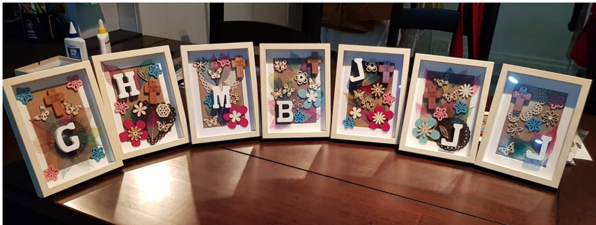
For Session 6 – The Victory of the Cross or any session you want personalised gifts for the BESTs (the letters here are the initials of the BESTs' names)