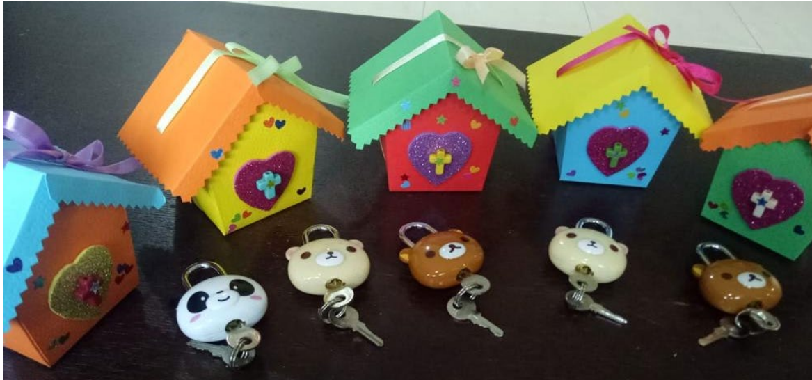
House with padlock and key for Session 5 – When God Comes Knocking